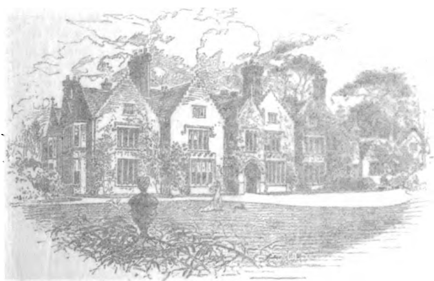
THE NASSAU HOUSE, 1850